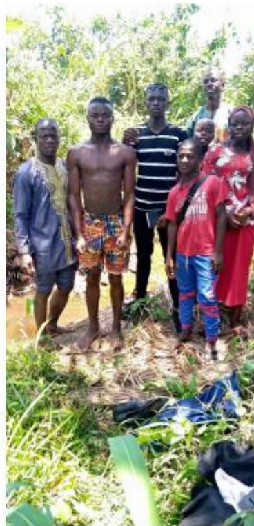
Conversion of Goba