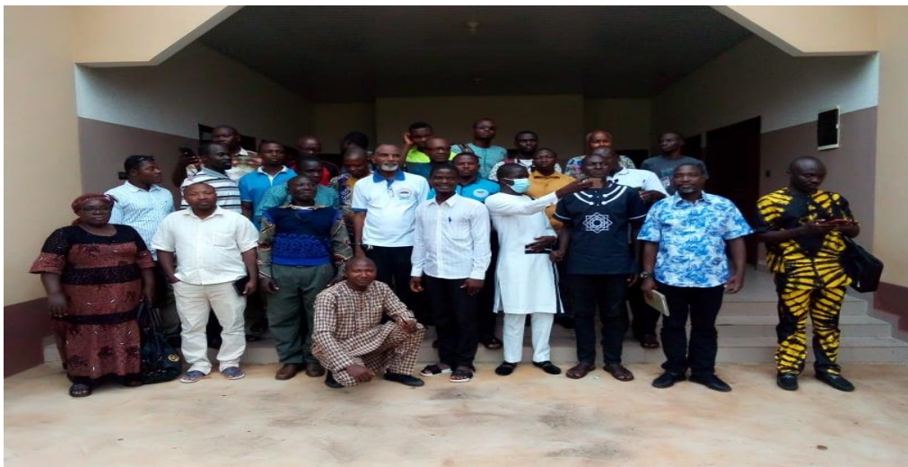
a- The graduation of evangelists at the end of their training from various French-speaking African countries including Guinea Conakry