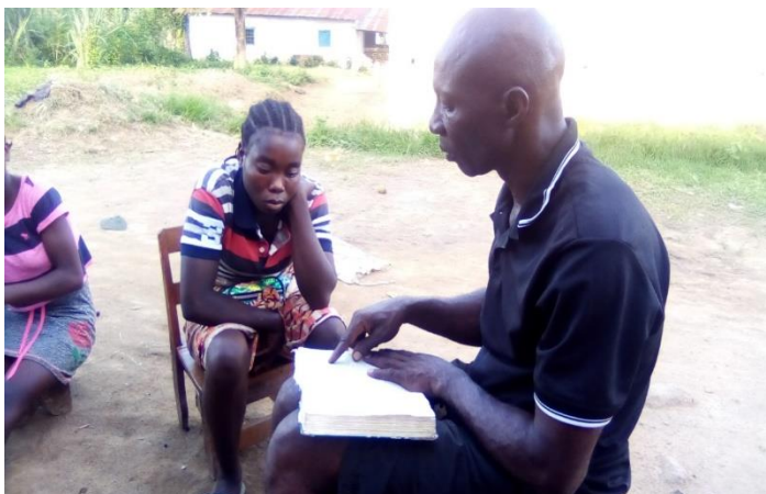
We are out in the field and studying with this sister. She is attending presently. Pray, the Lord will save her.